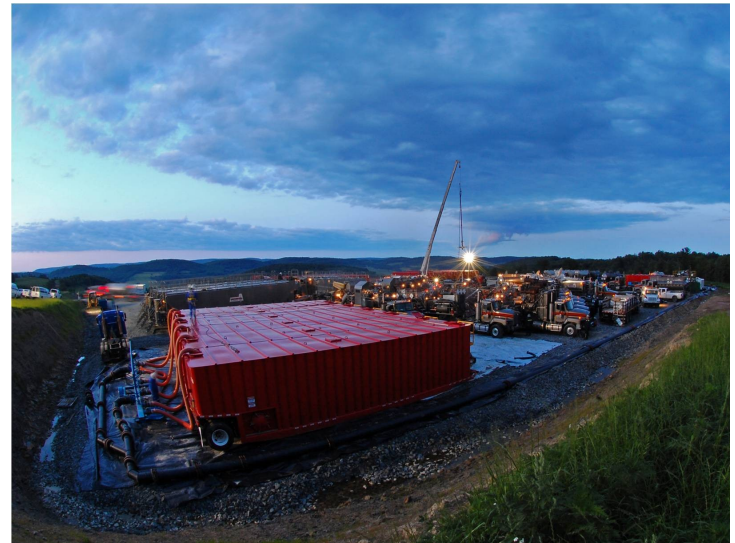
Wellsboro, PA - The drill site of Vineyard's largest Marcellus producer/partner, East Resources, Inc. In August 2010, East Resources' owner Terry Pegula, sold East Resources to Royal Dutch Shell for $4.7 billion. Though the name has changed, the gas remains the same. Vineyard and Shell continue to build on the relationship that was started with East Resources over 20 years ago.

At Vineyard Oil & Gas Company we specialize in purchasing natural gas from reliable local producers and providing it at the lowest possible price.